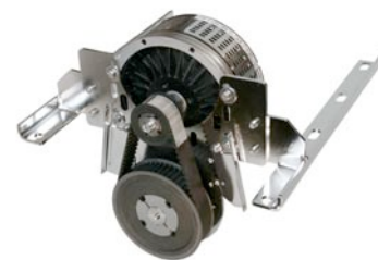
Motor, included console, with reduction and mounting brackets