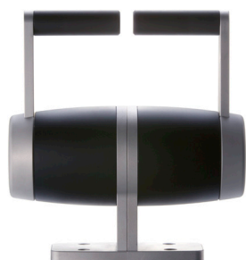
Dual top mounted throttles for twin engine applications