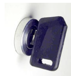
Key Switch System